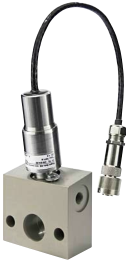
Prechamber Valve for gas injection