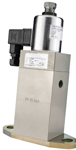
Pilot Valve for Start Valve